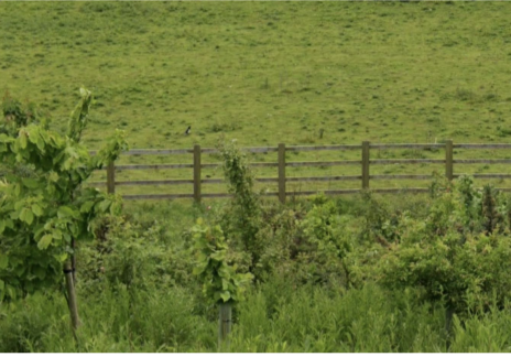
Existing fencing currently on site

KEY Proposed post and mesh fence - 1.2m high along existing line of highway boundary