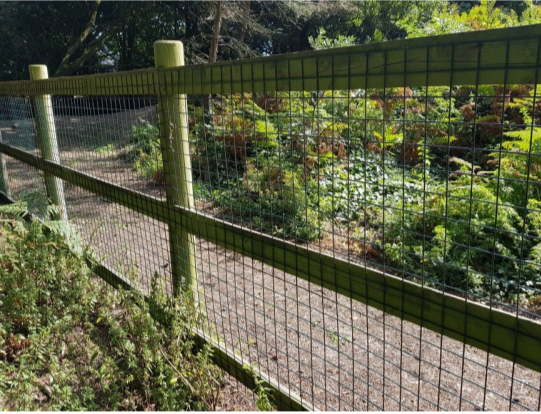
Illustrative image - Post and mesh fencing